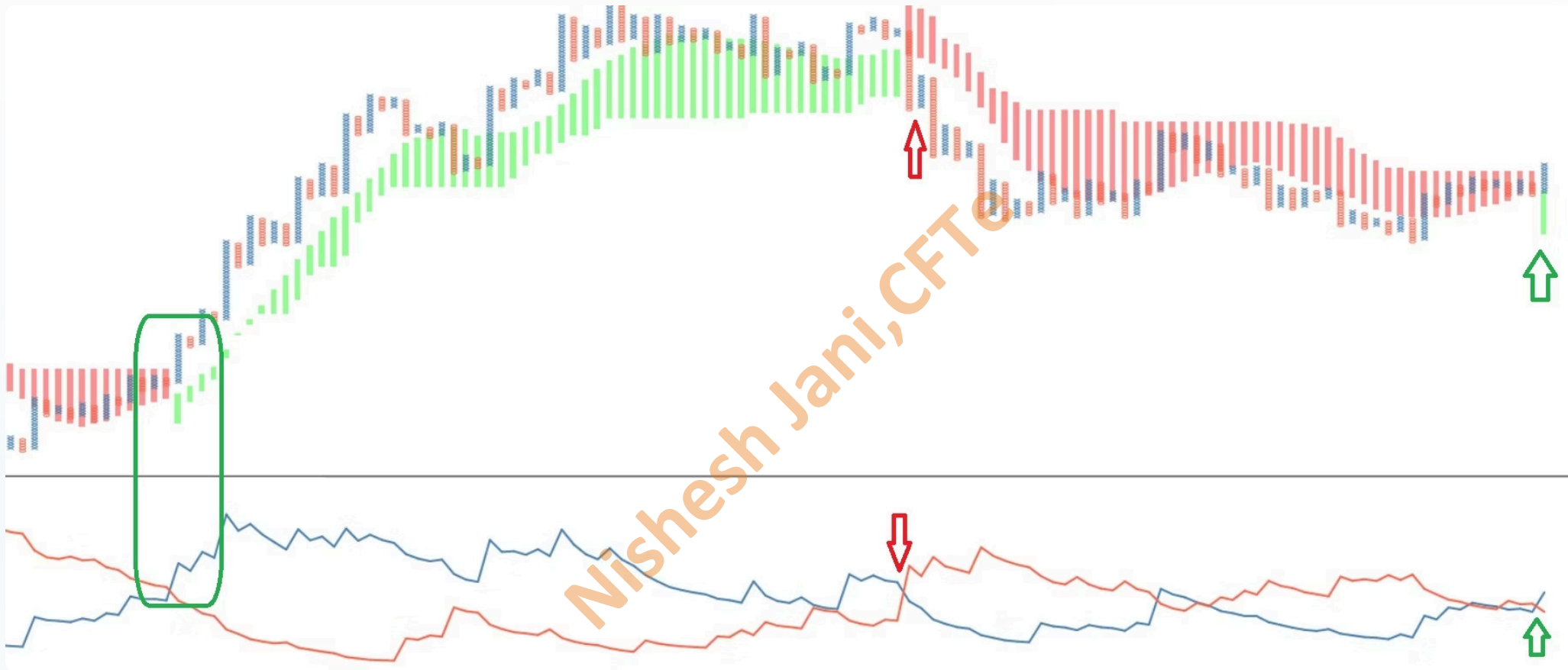
Horney Bull Market Setup Chart